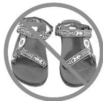
Sandals or Slippers

Participants are requested to arrive in a timely fashion for all addresses, whether to their own, or to those of other presenters. Presenters are reminded that the time slots should be divided fairly and equally between the number of presentations, and that they should not overrun. The session chair is asked to assume this timekeeping role and summarize clarify key important issues in each topic.