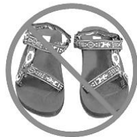
Sandals or Slippers

Participants are requested to arrive in a timely fashion for all addresses, whether to their own, or to those of other presenters. Presenters are reminded that the time slots should be divided fairly and equally between the number of presentations, and that they should not overrun. The session chair is asked to assume this timekeeping role and to summarize key issues in each topic.